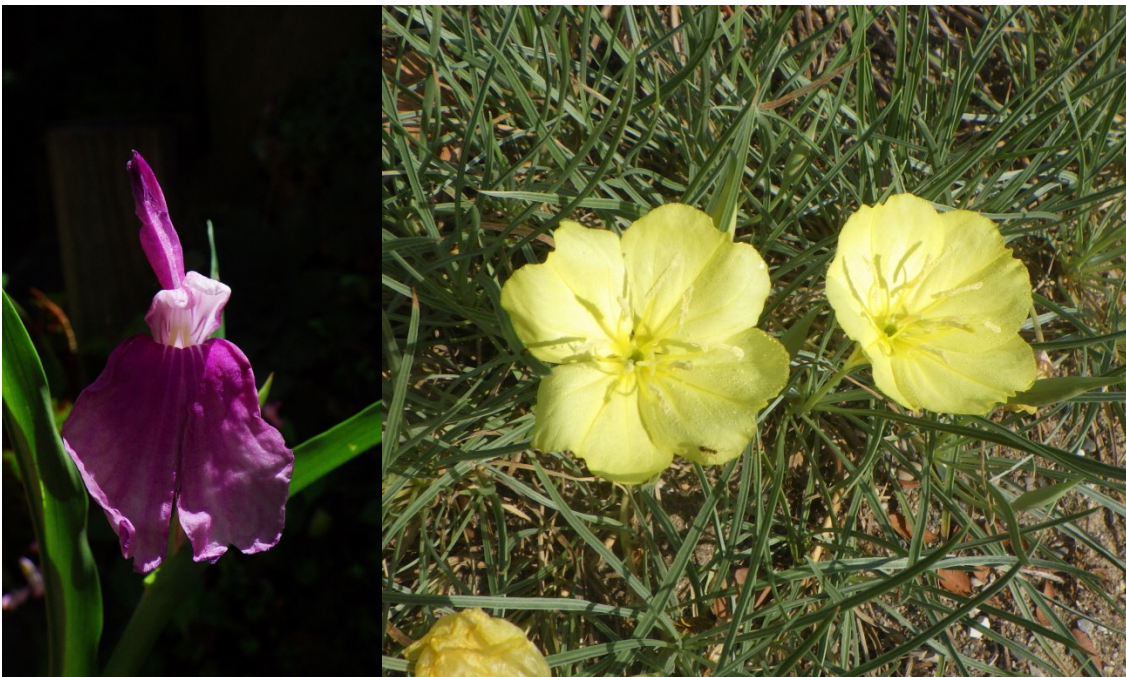
Roscoea auriculata – the last flower Oenothera fremontii – nice silvery leaves