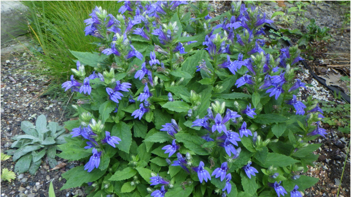
Lobelia siphilitica 'Mistassinica' – dwarf, mounding habit and easy to grow

A few more nice plants in bloom this weekend: