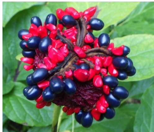
Paeonia willmottiae fruit – almost as showy as the flower!

This delay will have the added benefits of getting past the summer heat, acquiring more tufa, and an ability to have more volunteers participate.