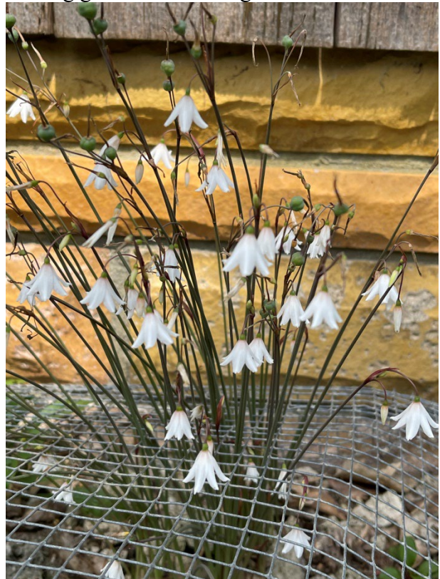
Acis autumnalis by the house – hardware cloth too keep chipmunks away. This is a choice small bulb that blooms nicely in the hottest part of the summer.

So what's in bloom now? Well we're not quite to the fall things yet. No fall color. The big show of asters and relatives – including some small enough for the rock garden – are just beginning, Cyclamen are starting, Colchicum are coming out in force, as are hardy begonias. So not terrible. Here are a few things that were looking good over the long weekend.