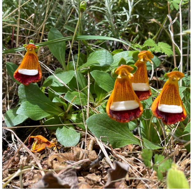
Calceolaria uniflora in Patagonia last winter! A plant everyone should see once in their lifetime!