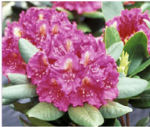
RHODODENDRON PEARCE'S AMERICAN BEAUTY

American Rhododendron Society — Ann Arbor Sale — Page 3/3