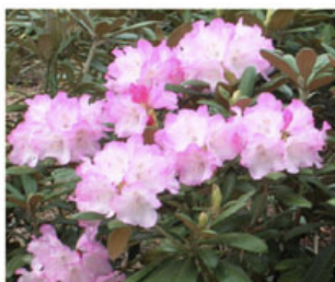
RHODODENDRON DOROTHY SWIFT

American Rhododendron Society — Ann Arbor Sale — Page 2/3