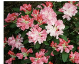
RHODODENDRON YAKU PRINCE