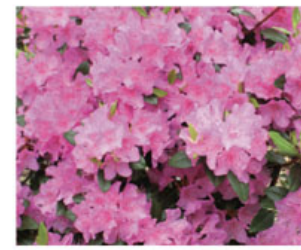
RHODODENDRON OLGA MEZITT