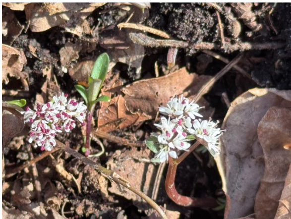
Erigenia bulbosa in bloom March 28.

Now here are a few garden plants out in the rock garden, in bloom March 29.