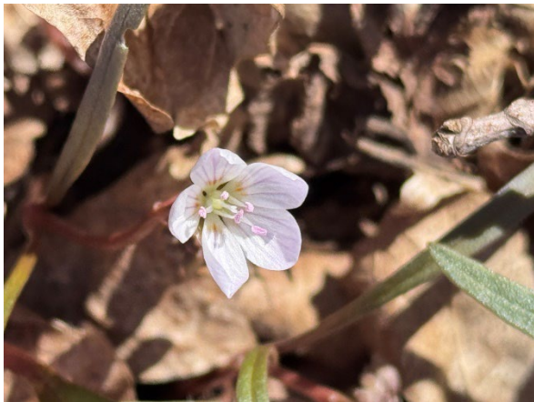
Claytonia virginica in bloom March 28.

Yesterday, I saw my first spring beauty in the Ann Arbor area, looking for a patch of harbinger-of-spring ( Erigenia bulbosa – a tiny but lovely thing that should be great to display in a trough – it looks just like an alpine).