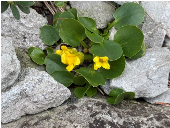
Ficaria kochii – large buttercup flowers (that would be open if the day were sunny) A great small plant from western Asia, blooming very early.