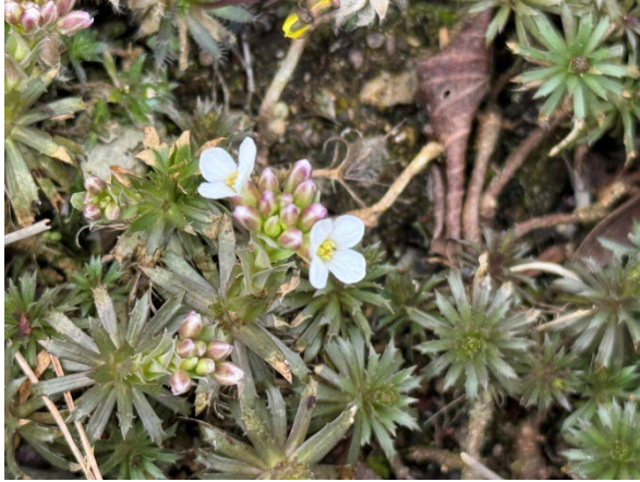
Noccaea (Coluteocarpus) vesicaria just beginning to open.