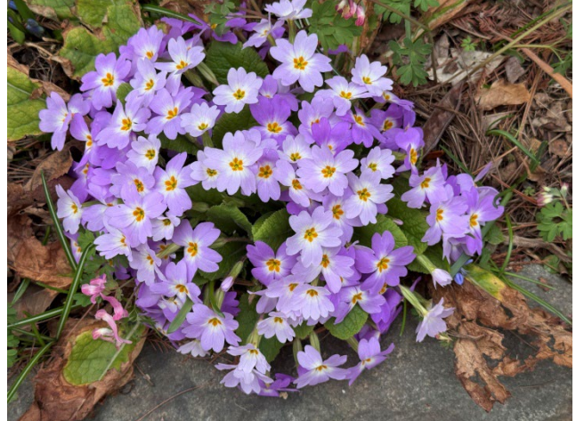
Primula vulgaris subsp. sibthorpii – in bloom since mid-March! Anybody know if this is some special cultivar? Plants of the world on line calls it Primula vulgaris subsp. rosea . A great plant, whatever the name, and immune to cold!