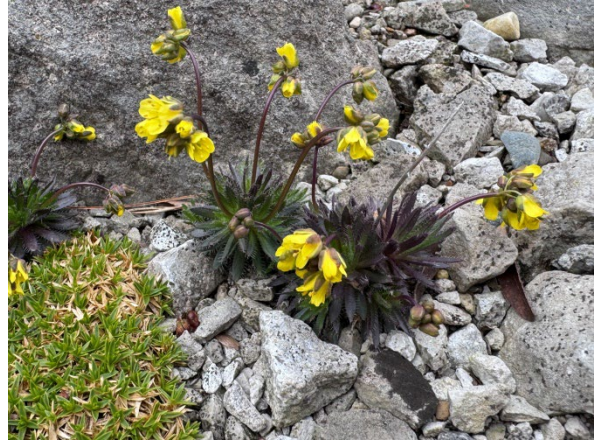
Draba (aizoides?) – Always the earliest.

Now here are a few garden plants out in the rock garden, in bloom March 29.