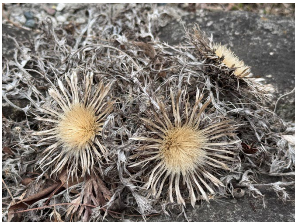
Not a flower, last year's fruiting heads of Carlina acaulis – but cool looking...