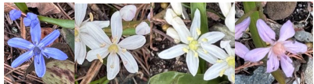
Scilla bifolia colors, left to right: normal (blue), forma rosea (very pale pink), pure white form, richer pink form

Please send address and contact information changes to: